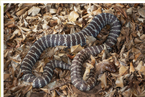
Barred Spitting Cobra ( Naja nigricincta nigricincta )