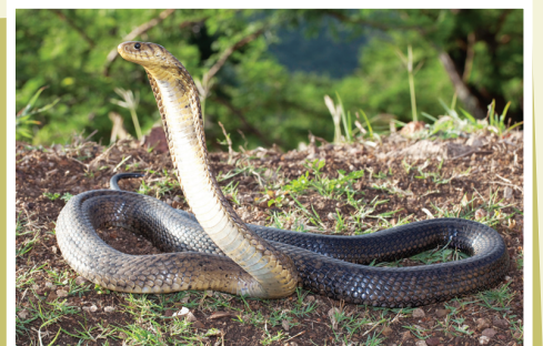
Forest Cobra ( Naja melanoleuca )