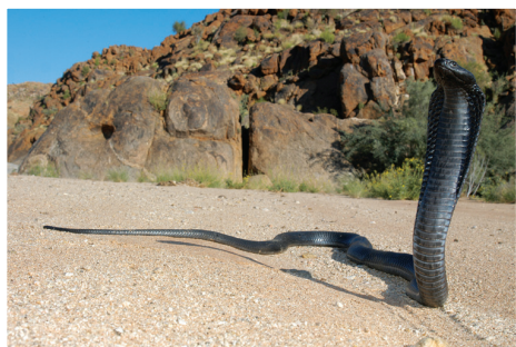
Black Spitting Cobra ( Naja nigricincta woodi )