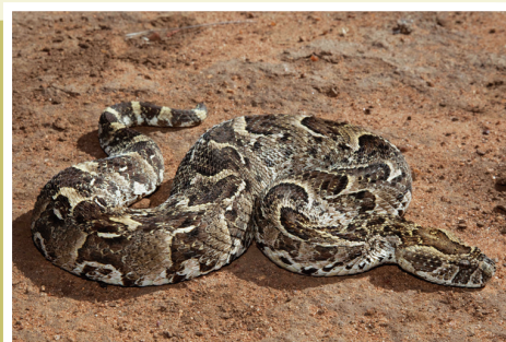
Puff Adder ( Bitis arietans arietans ) from Limpopo