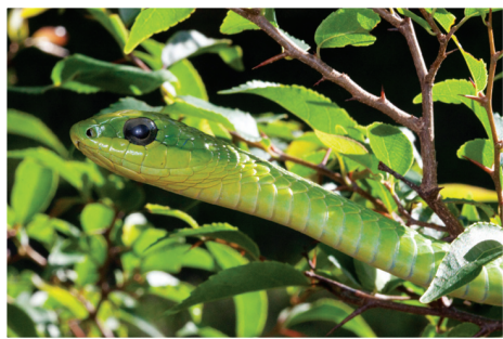
Boomslang ( Dispholidus typus ) male from Mpumalanga