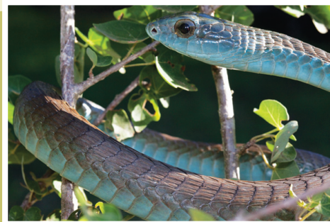
Boomslang ( Dispholidus typus ) female