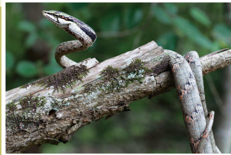
Vine Snake ( Thelotornis capensis capensis )