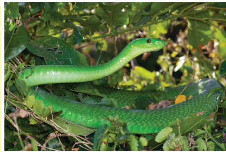
Green Mamba ( Dendroaspis angusticeps )