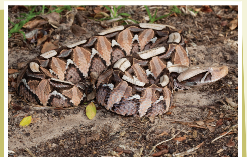
Gaboon Adder ( Bitis gabonica )