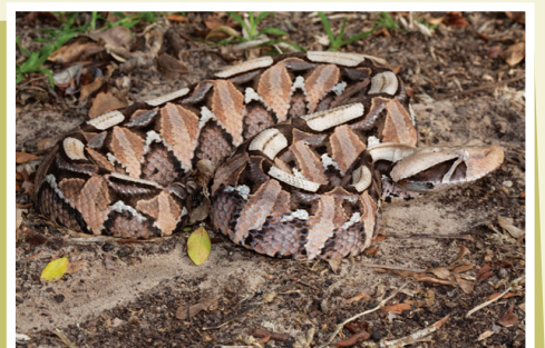
Gaboon Adder ( Bitis gabonica )