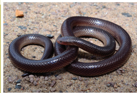
Stiletto Snake ( Atractaspis bibronii )